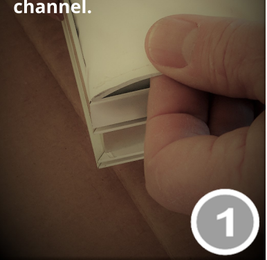
Do this on both sides of the corner and then repeat for all four corners.

Begin in a corner. Insert about 2 inches of the fabric panel into the channel.